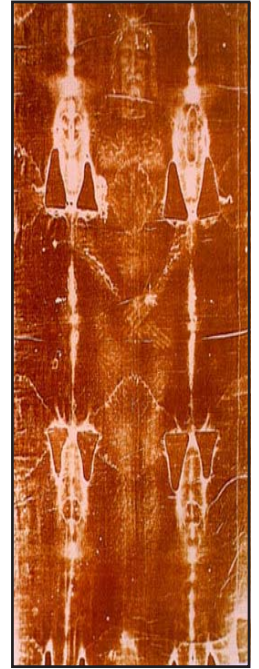
Shroud of Turin