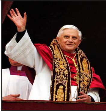
Pope Benedict XVI

Shroud of Turin Main Tour May 11-20, 2010 Extra Days in Rome May 20 - 23, 2010