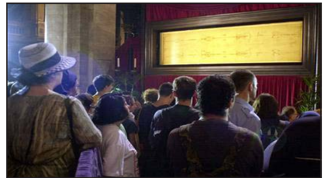
Pilgrims view authentic Shroud of Turin