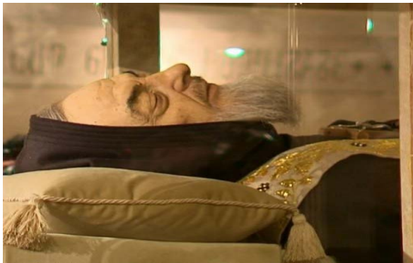
Tomb of Padre Pio